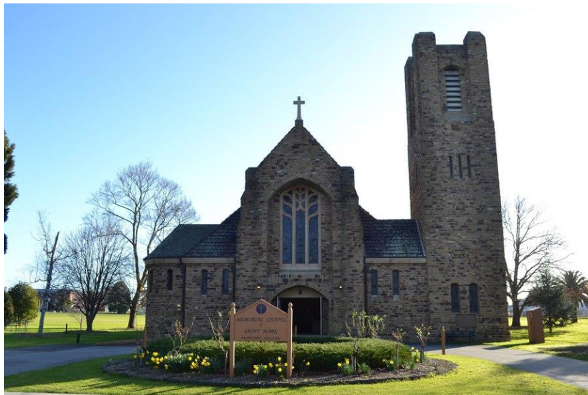
HMAS Cerberus Protestant Chapel of St Mark, Crib Point, Victoria