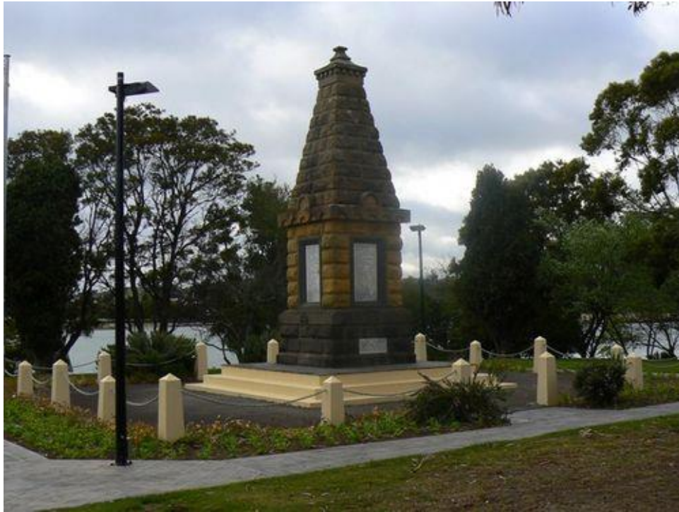
Devonport Cenotaph