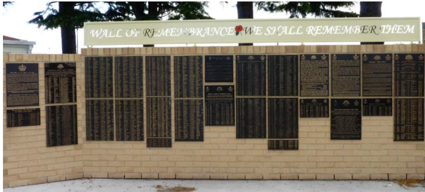
Wall of Remembrance, St. Helens, Tasmania