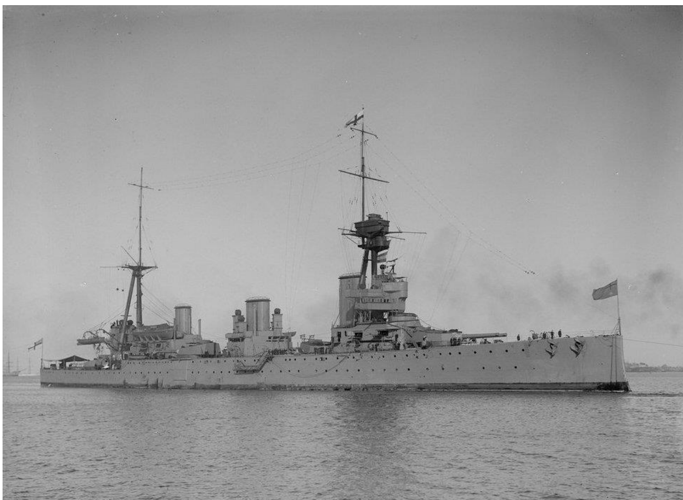
H.M.A.S. Australia 1914