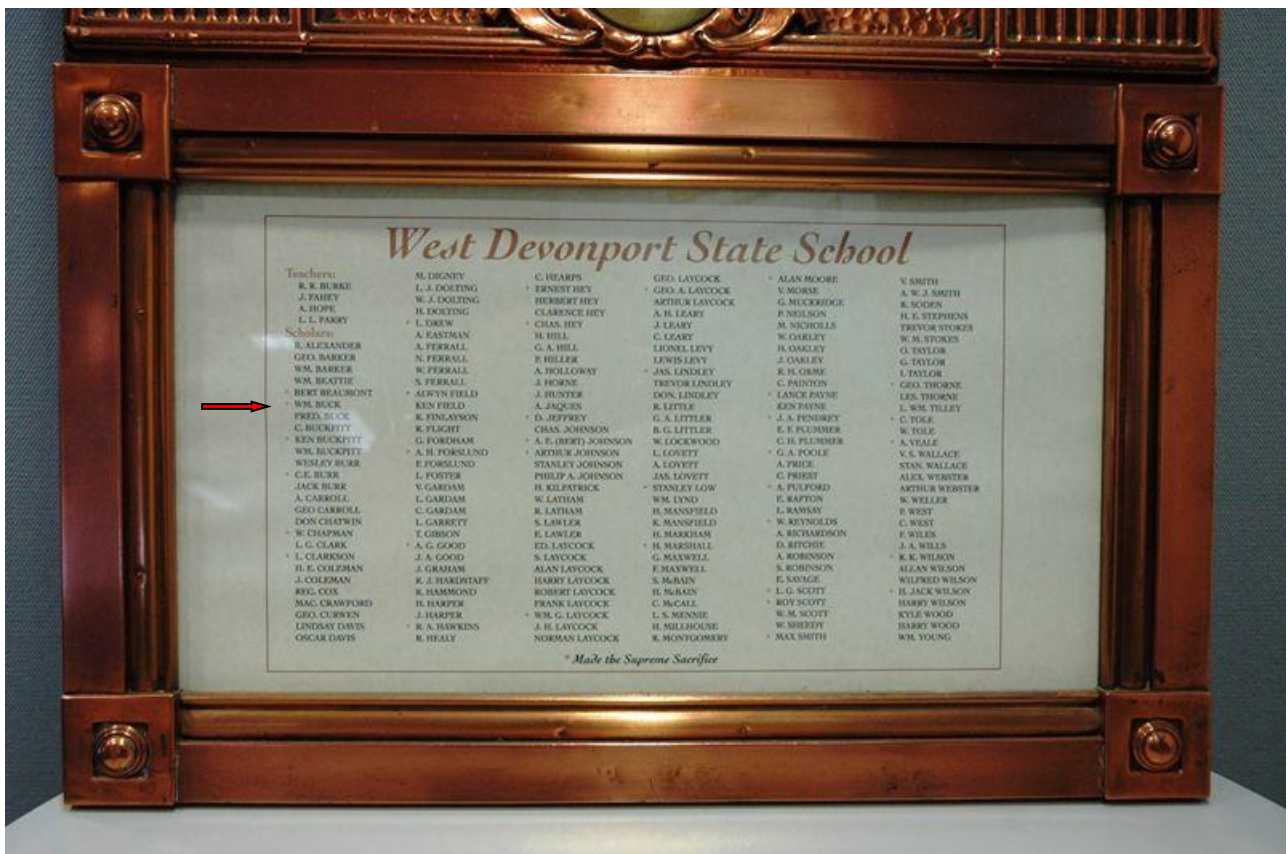
West Devonport State School Roll of Honour